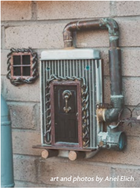
art and photos by Ariel Elich

AN AUTHENTIC MIX OF REAL PEOPLE, LOCALLY-OWNED ONE-OF-A-KIND SHOPS,