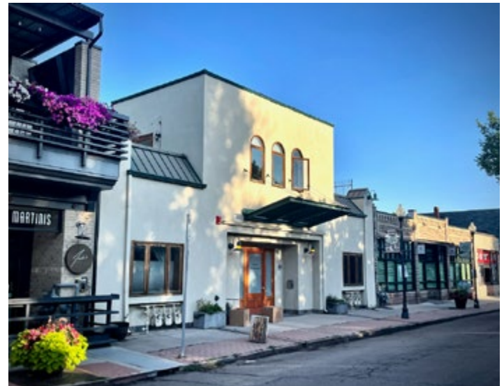
Then – The Mission Theater